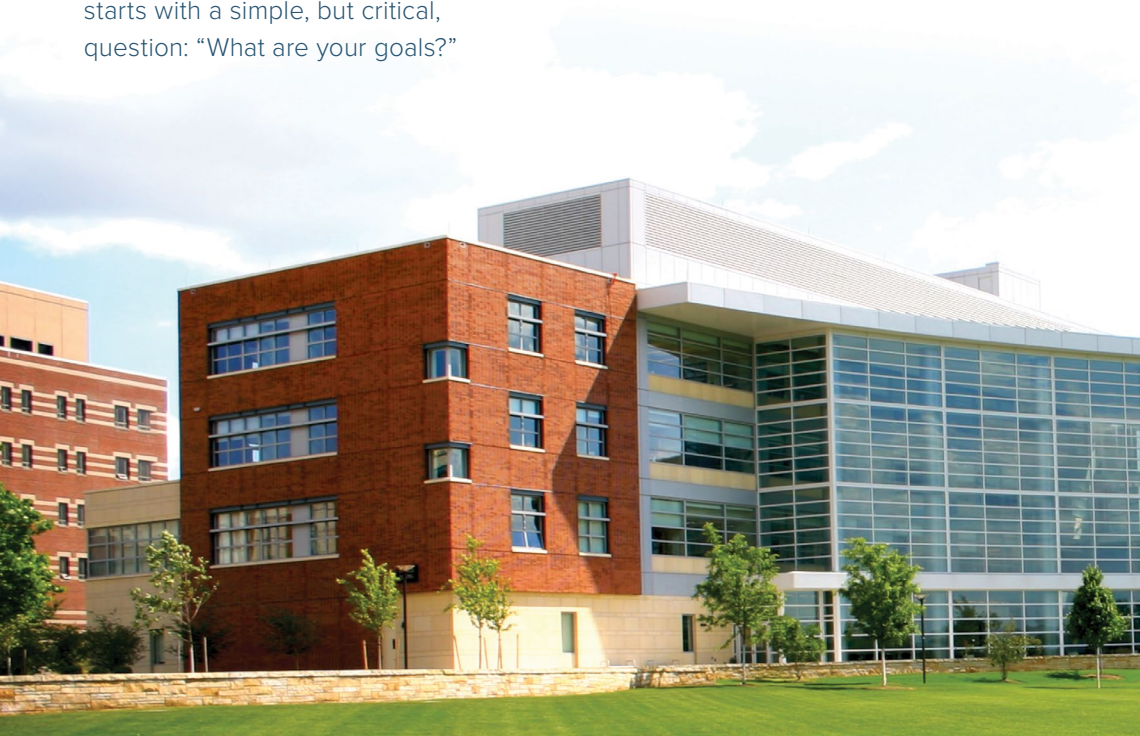
The Penn State Smeal College of Business, University Park, PA

Our Alumni Career Services team will support you across all career stages with professional advancement opportunities and coaching to help you stay focused on achieving your goals.*